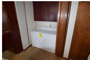
Main Floor Laundry