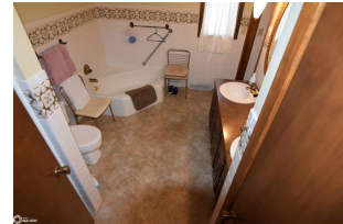
Main Floor Bathroom