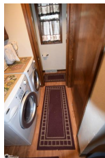
Main Floor Laundry